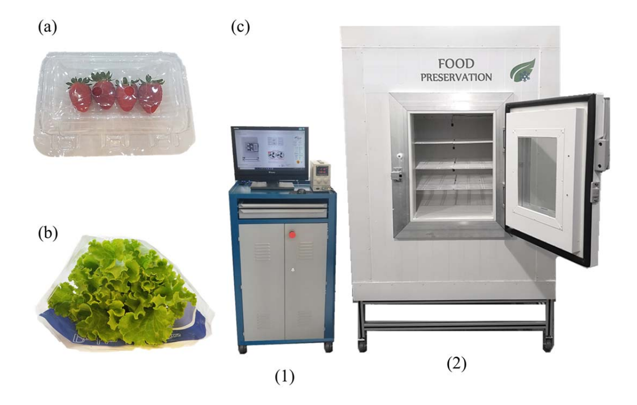
Figure 1: Packaged strawberry (a) and lettuce (b) samples for cold storage. Experimental facility (c) divided into a control unit (1) and the refrigeration system (2).

The experimental facility was designed to reproduce household refrigerator conditions and, as seen in Figure 1c, the experimental facility consists of a control unit (1), responsible for air temperature, humidity and air velocity control, inside the refrigeration system (2). The refrigeration system control parameters were monitored during the tests with a humidity sensor (model 6621, Testo, uncertainty of \pm 2.0 % RH), a six-coupled hot wire anemometer (UAS 1000, Degree Controls, uncertainty of \pm 3 %) for air velocity measurement and adjustment and four thermocouples (type T, OMEGA, uncertainty of \pm 0.2 °C), one on each shelf, to record the air temperature. The food storage was carried out under refrigeration at 5 \pm 1 °C for 5 days, with relative air humidity of 50-60 % and air velocity of 0.2 m s<sup>-1</sup>.