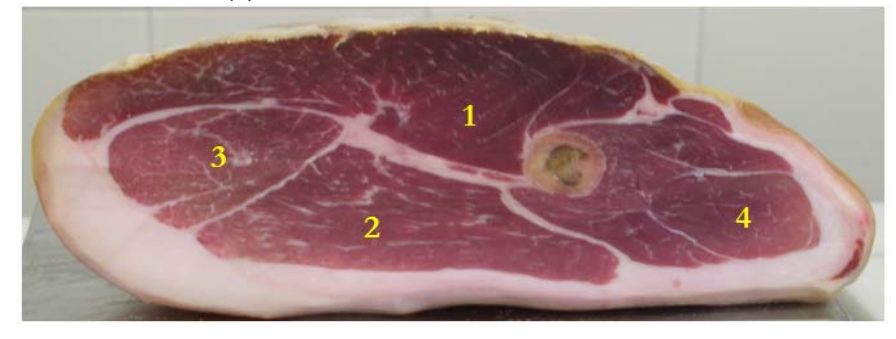
Figure 1. Main muscles of row ham slices.

The experiments were conducted considering 160 slices of raw hams from different production areas and purchased in different sales outlets located in Foggia (Puglia – Italy) and Modena (Emilia, Italy). In particular, 20 slices with a thickness of 10 mm of each of the following raw hams were purchased: Cremona, Deli Emilia, Faeto, Parma, Castelluccio, San Daniele DOP, Norcia IGP and Parma DOP; these hams, all aged for 16 months, are hereinafter referred to with the letters A, B, C, D, E, F, G and H respectively. The 16-month maturation was chosen as with this stage of maturation it was possible to find in the sales points, as reported on the labels, both raw hams prepared with the use of potassium nitrate (those named with the letters B and C), and with the use of potassium nitrite (the one named with the letter B), and raw hams prepared without the use of additives (those named with the letters F, G and H). In addition, some hams were taken into consideration even if the labels did not contain any information on the use of additives in the production phase (those named with the letters D and E). For each of the hams taken into consideration, the 20 samples were taken from the central section of the whole product so that in all the samples the main muscles of the ham were present (figure 1), i.e., the Semimembranosus (1), the Biceps femoris (2), the Semitendinosus (3) and the Rectus femoris (4).