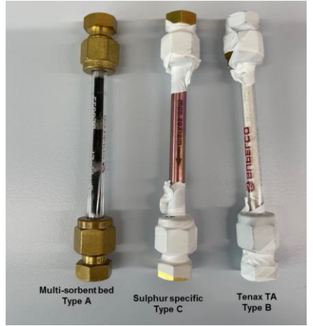
Figure 1: Sorbent tubes used in this study

Tubes A (Multi-sorbent bed), developed and described in (Ribes et al., 2007), are designed for the determination of both polar and non-polar VOCs, to be adopted in different scenarios and obtain the collection of different classes of compounds. For A and B types, sorbent materials were inserted manually inside glass tubes, obtained from Supelco (Bellefonte, PA, USA). On the contrary, types C, and inert-coated stainless-steel tubes were adopted.