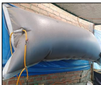
Figure 1: Biogas obtained under anaerobic conditions with sludge