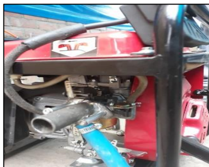
Figure 2: Mixer (generator biogas conversion) at the carburetor inlet

For the conversion, the biogas concentration was evaluated with the Multitec® 540 equipment, which measures the mixture of gases produced during biological processes. Concentrations of 57.7% methane ( \text{CH}_4 ), 33% carbon dioxide ( \text{CO}_2 ) and 10 ppm of hydrogen sulfides ( \text{H}_2\text{S} ) were found, thus presenting the appropriate characteristics to generate electricity. For this, a four-stroke electric generator (gas station), 3.0 HP, single-cylinder, with a rotation speed of 3000 rpm, maximum output power 1500 watts, with a 25 mm diameter carburetor was used. The mechanism consists of placing a gas mixer at the carburetor inlet whose function is to mix the biogas and the air appropriately. To start up the generator set, a little gasoline was used to activate the spark ignition, to then closed the gasoline tap and opened the biogas tap at an angle of 45^\circ . Figure 2 shows the converter mixer equipment at the carburetor inlet of a generator set.