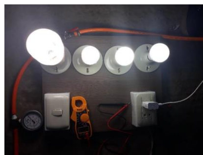
Figure 3: LED light bulbs powered by biogas energy