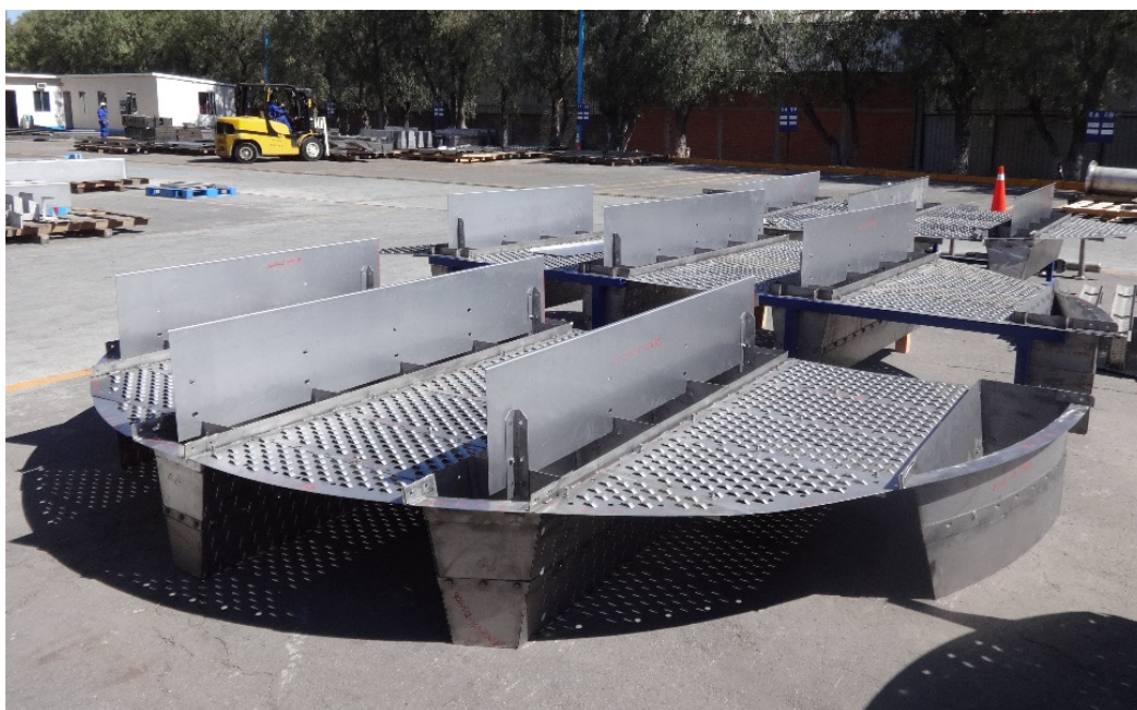
Figure 1: Two Half-Tray Trial Layouts of the HiFi Plus Tray for PV-1767

With adjustments to upstream cracking, the feed ethylene purity would become higher in ethylene content as well as higher in overall throughput. The feed tray was moved higher in the tower to above tray 45 (counted from the bottom) and the side reboiler draw and return location moved up to tray 37 as well. Note that the old liquid withdraw nozzles for the side reboiler were used after the revamp and that internal piping was used to get the liquid from tray 37 down to tray 32 for withdraw. HiFi Plus trays were chosen because of positive past experience in C 2 Splitter service as depicted in the referenced publication by Summers, et al from 2007. These trays are comprised of multiple sloped and truncated downcomers with active tray deck area between. The prominent feature of the HiFi tray is its long weir length which enables high liquid loaded systems to operate at reduced weir loading and achieve high capacity, see Figure 1. The other prominent feature is a defined flow path length which enables this tray to achieve very good tray efficiencies.