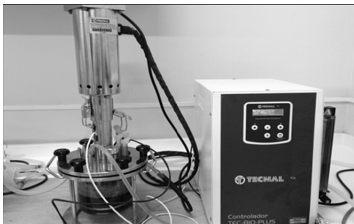
Figure 1: Biosurfactant production by C. guilliermondii in bioreactor

The production of biosurfactant in bioreactor 1.2 L was performed in distilled water based medium with 4.0 % of corn steep liquor, 2.5% of molasses and 2.5% residual soybean oil. The medium was sterilised by autoclaving at 121 °C for 20 min (all components were sterilised together). The final pH of the medium was 5.5.