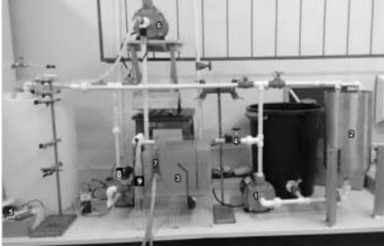
Figure 2: Bench DAF Prototype used for treating the oily aqueous phase

stored in a tank (2). The flow of the oily aqueous phase to be treated passes through the flotation cell (3), with a volumetric flow rate adjusted by the opening of a valve (4). The control variables of the operating conditions of the system, such as levels and volumetric flow rates of the fluid, are recorded with the aid of an electronic circuit (5). Part of the treated water is sucked in by a centrifugal pump (6), saturated with air microbubbles. The dispersed oil droplets are surrounded by air microbubbles and float, giving rise to a kind of oily foam, which falls into a foam collector (7). A third centrifugal pump (8) sucks the remaining treated water and sends it for reuse. A Level Sensor Control System (9) keeps the prototype operating at steady state.