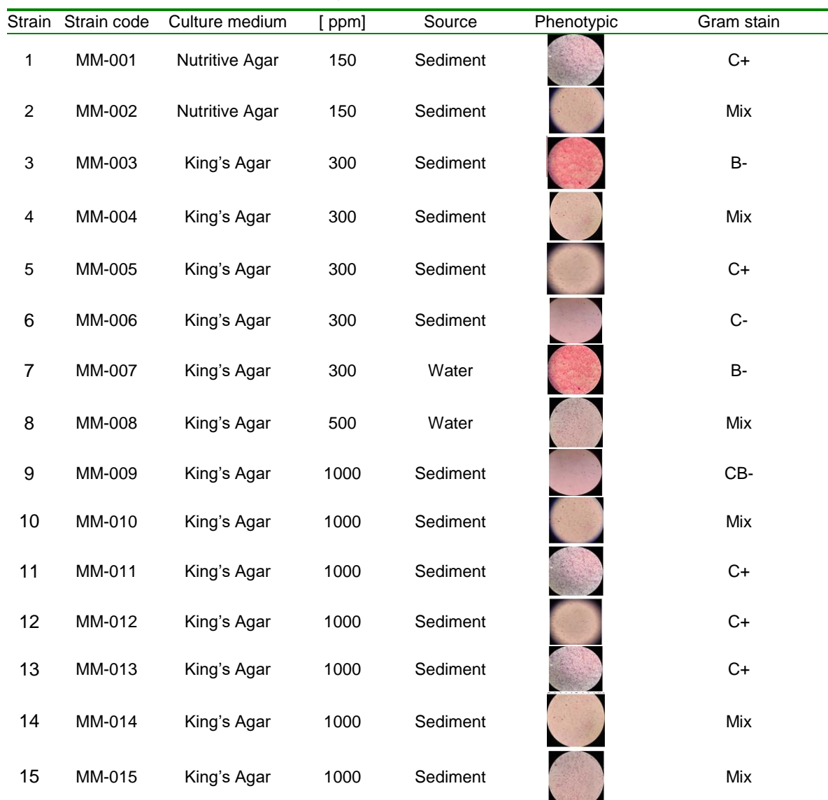
Table 1: Phenotypic characteristics of isolated bacteria

When comparing the diversity of microorganisms that grew in nutritive and King Broth, negative bacilli growth was observed in all, except for King Broth with a water sample, being able to determine a greater load of microorganisms in sediments. The selective isolation of bacteria from the water and sediments found in the Bay of Cartagena made in different broths, showed better results in Nutritive and King broth, where there was greater biomass and diversity, finding Gram positive and negative bacilli, such as Gram positive cocci in the sediments. , as well as a faster growth from 18 to 24 hours, as can be seen in Table 1.. The biochemical characterization of the chosen morphotypes were, MM-001 ( Bacillus subtilis ), MM-005 ( Bacillus megaterium ), MM-007 ( Escherichia coli ), MM-009 ( Citrobacter koseri ).