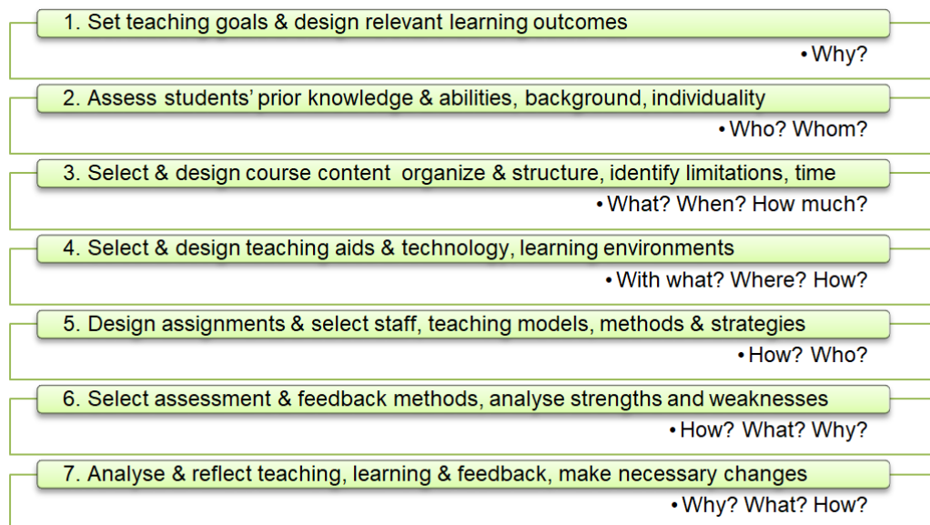
Fig. 1 The basic didactic model of Engineering Pedagogy Science (EPS)

The first step in developing a training program is to identify a simple and explicit model that meets the requirements of stakeholders. In this case, the most relevant structure is the basic didactic model of Engineering Pedagogy Science (EPS), e.g., Figure 1. This model has been described by (Ruttmann, 2019) based on the student-teacher partnership supported by an interdisciplinary approach and an integrated learning content that follows a precise and logical structure.